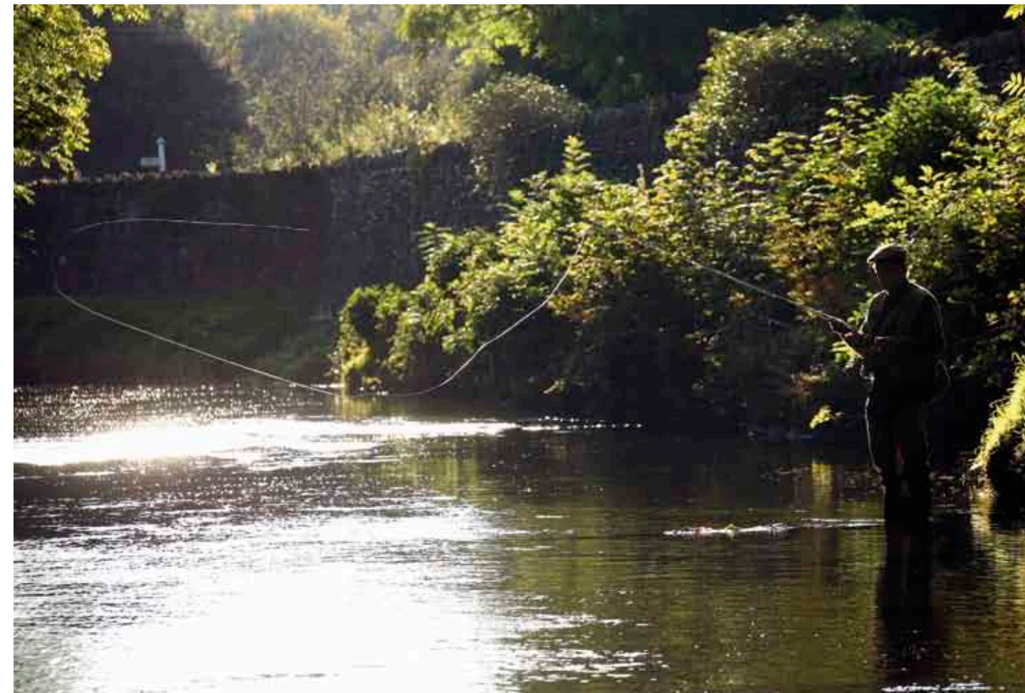
Take your pick: the renowned Arundell Arms in Devon has access to fishing on the Rivers Tamar, Lyd, Wolf, Thrushel and Carey