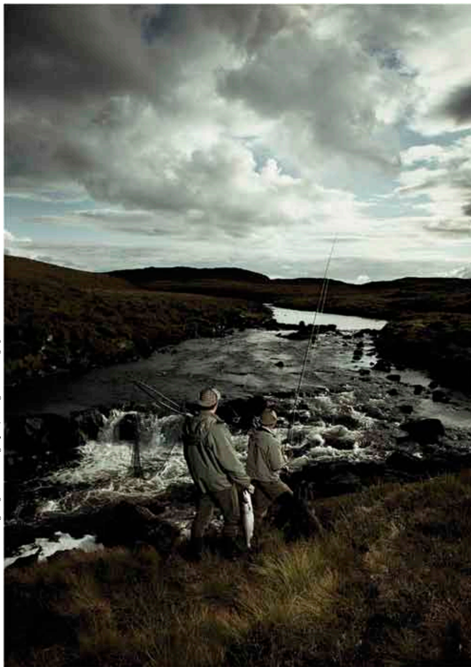
Salmon have been known to charge flies at the Grimersta estate on the Isle of Lewis

sometimes called 'the birthplace of stillwater trout fishing'—a description most Scottish loch anglers would dispute, although many techniques were pioneered here, especially midge fishing during the evening rise known as the 'Blagdon Boil'. At 440 acres, it has good access to indented shorelines for bank anglers, and boats are available (I'd bring an electric outboard). My favourite drifts are across Butcombe Bay, and along Ash Tree in a westerly breeze, when you can expect good surface sport to sedges and hoppers (Woodford Lodge: 01275 332339).