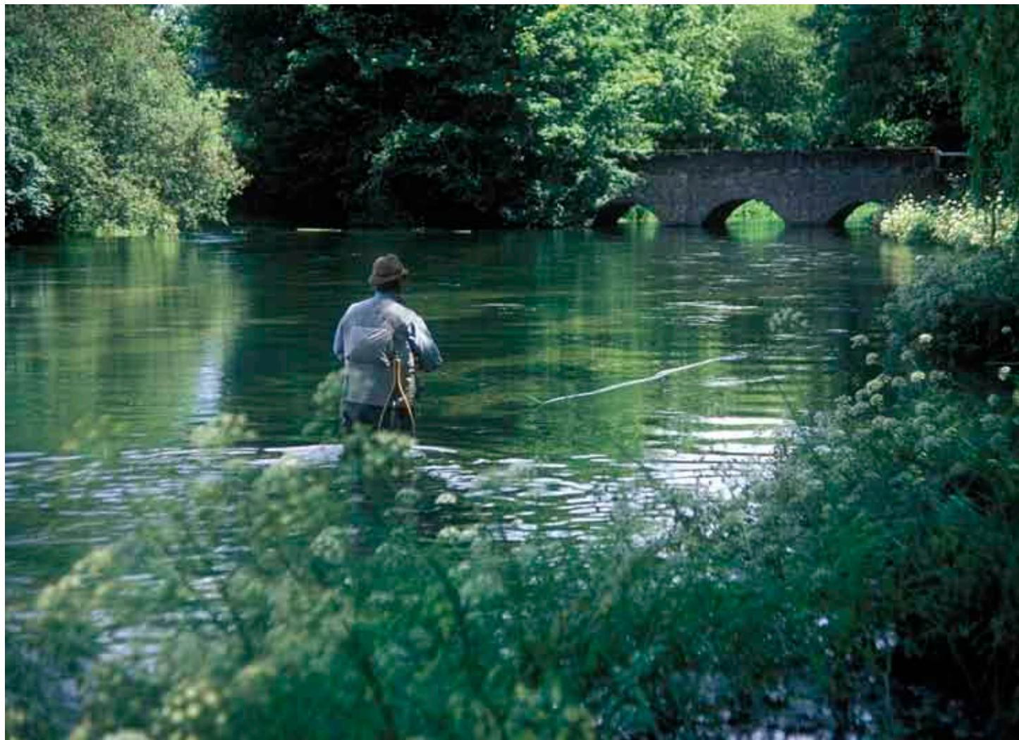
Previous pages Perfect peace at the Junction pool of the Towy and Cothi at Abercothi. Above Cast in the wake of the greats on the hallowed River Itchen. Facing page Even in a Bristol Water reservoir, there can be excellent fishing from boat and bank

T O hear some anglers talk about their plans for the coming season, you would think their most essential item of tackle was a passport. But here in the UK, we still have many world-class sporting opportunities, and this is my personal selection of our crème de la crème . (Any proprietors feeling aggrieved at being left out are welcome to invite me along for a visit...)